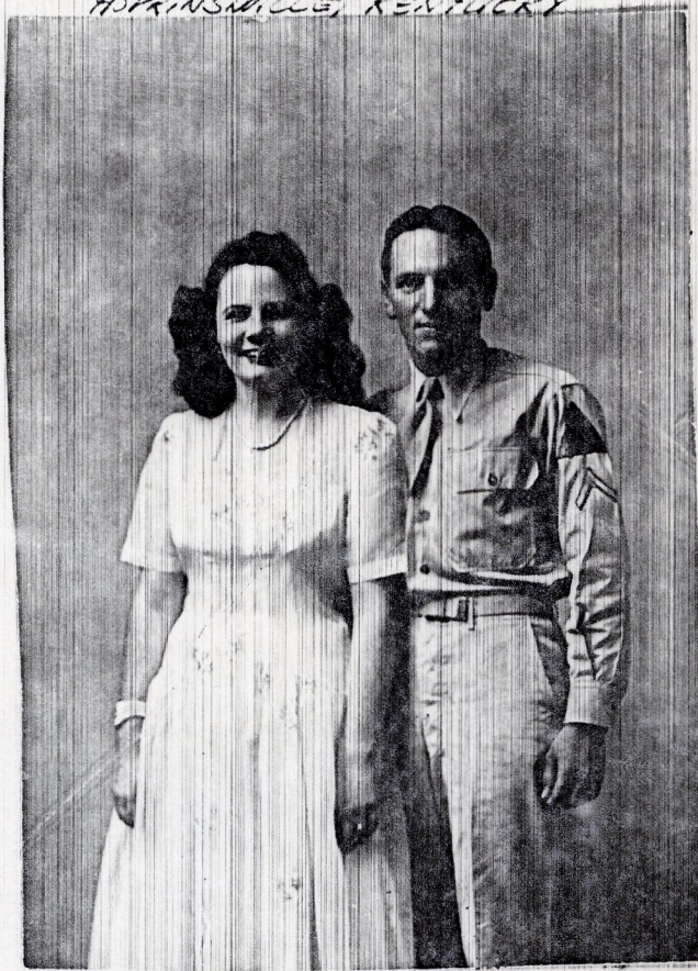
OUR WEDDING MARRIAGE PICTURE TAKEN IN MT. CLEMENS.